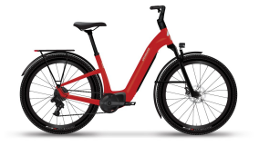
Red Tint / Silver Reflective