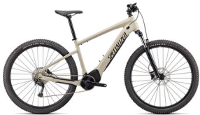
White Mountains / Gunmetal

The new Turbo Tero is an electric mountain bike equipped for everyday rides. A mountain bike that you can commute on. A commuter you can take touring. A touring bike that you can haul freight with. Whatever you need it to be, for wherever you want to go. A true do-it-all superhero, Tero combines adaptable utility with World Champion mountain bike DNA and category-leading electric pedal assist.