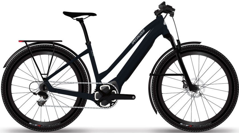
Cast Black / Silver Reflective