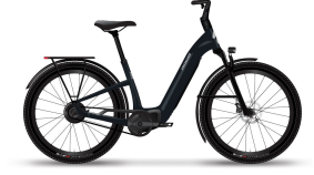
Cast Black / Silver Reflective

Como is a laid-back, comfortable e-Bike with the power of a confident ride. Como lets you go with the flow by giving you a full-power, confidence-inspiring, utterly delightful experience on a bike that feels effortless to ride.