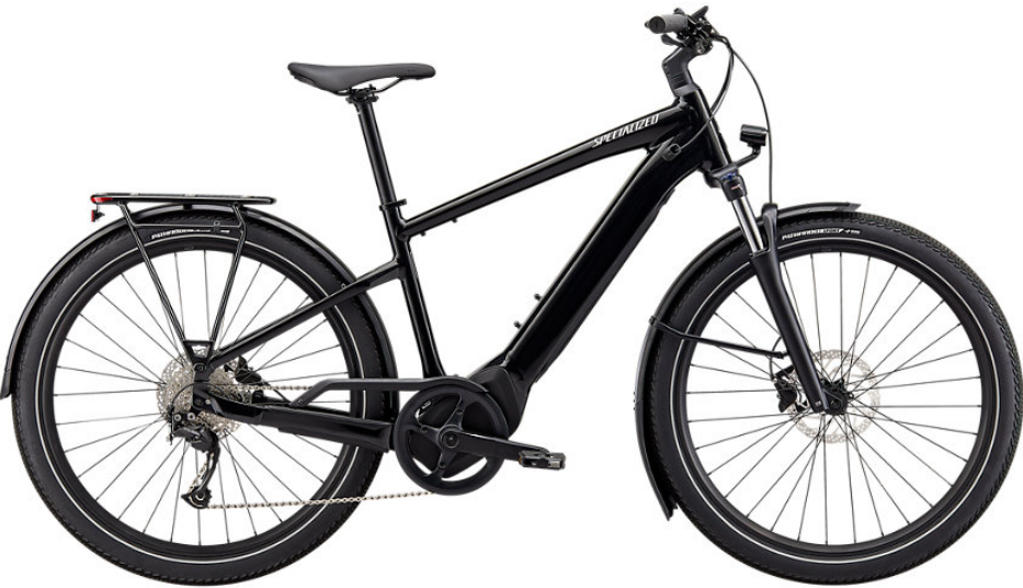
Cast Black / Silver Reflective