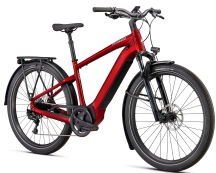
Red Tint / Silver Reflective