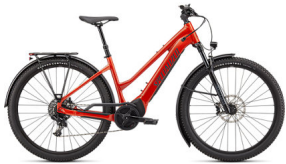
Redwood / Black

The new Turbo Tero is an electric mountain bike equipped for everyday rides. A mountain bike that you can commute on. A commuter you can take touring. A touring bike that you can haul freight with. Whatever you need it to be, for wherever you want to go. A true do-it-all superhero, Tero combines adaptable utility with World Champion mountain bike DNA and category-leading electric pedal assist.