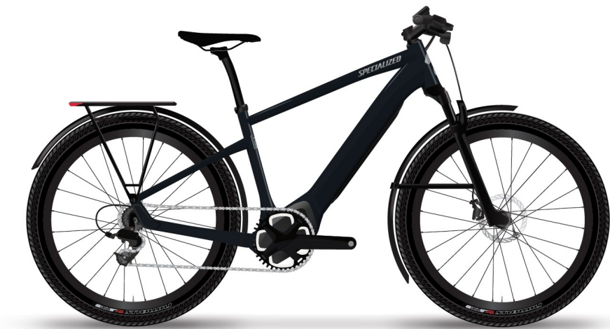
Cast Black / Silver Reflective