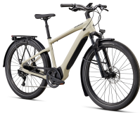
White Mountains / Black Reflective

Vado is the vehicle for everything from daily commutes to fast workouts to longer-than-planned adventures—an electric bike for life. The smoothest-riding e-Bike experience yet, Vado is designed to boldly take on the ever-changing landscape you'll encounter as a daily rider, carry whatever you need it to, and keep you riding more often.