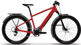
Red Tint / Silver Reflective