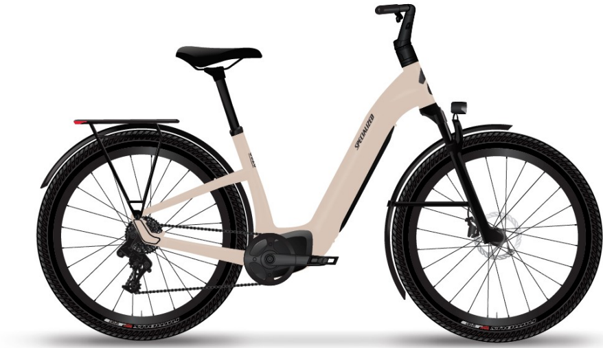
Sand / Black Reflective