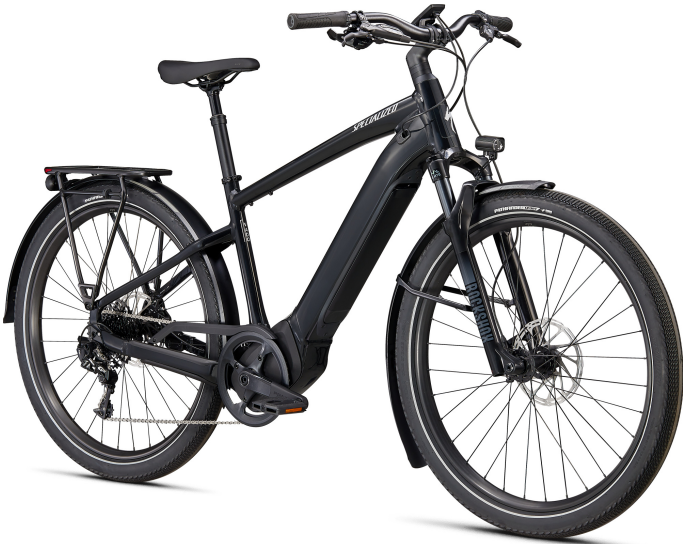
Cast Black / Silver Reflective