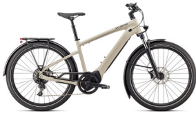
White Mountains / Black Reflective

Vado is the vehicle for everything from daily commutes to fast workouts to longer-than-planned adventures—an electric bike for life. The smoothest-riding e-Bike experience yet, Vado is designed to boldly take on the ever-changing landscape you'll encounter as a daily rider, carry whatever you need it to, and keep you riding more often.