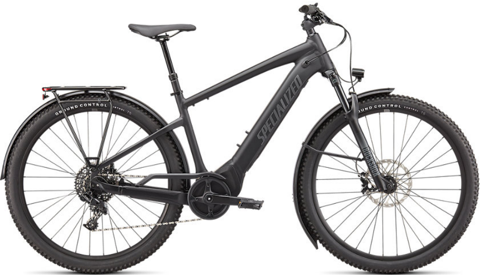
Black / Black