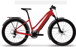
Red Tint / Silver Reflective