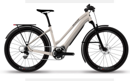
White Mountains / Black Reflective

Vado is the vehicle for everything from daily commutes to fast workouts to longer-than-planned adventures—an electric bike for life. The smoothest-riding e-Bike experience yet, Vado is designed to boldly take on the ever-changing landscape you'll encounter as a daily rider, carry whatever you need it to, and keep you riding more often.