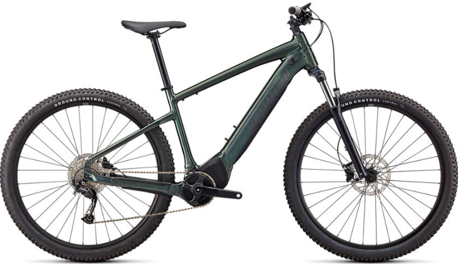
Oak Green Metallic / Smoke