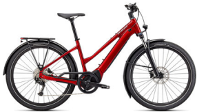
Red Tint / Silver Reflective