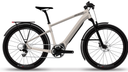
White Mountains / Black Reflective

Vado is the vehicle for everything from daily commutes to fast workouts to longer-than-planned adventures—an electric bike for life. The smoothest-riding e-Bike experience yet, Vado is designed to boldly take on the ever-changing landscape you'll encounter as a daily rider, carry whatever you need it to, and keep you riding more often.