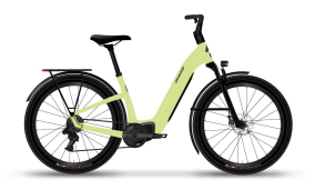
Limestone / Black Reflective