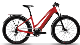
Red Tint / Silver Reflective