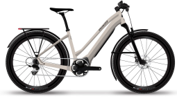
White Mountains / Black Reflective

Vado is the vehicle for everything from daily commutes to fast workouts to longer-than-planned adventures—an electric bike for life. The smoothest-riding e-Bike experience yet, Vado is designed to boldly take on the ever-changing landscape you'll encounter as a daily rider, carry whatever you need it to, and keep you riding more often.