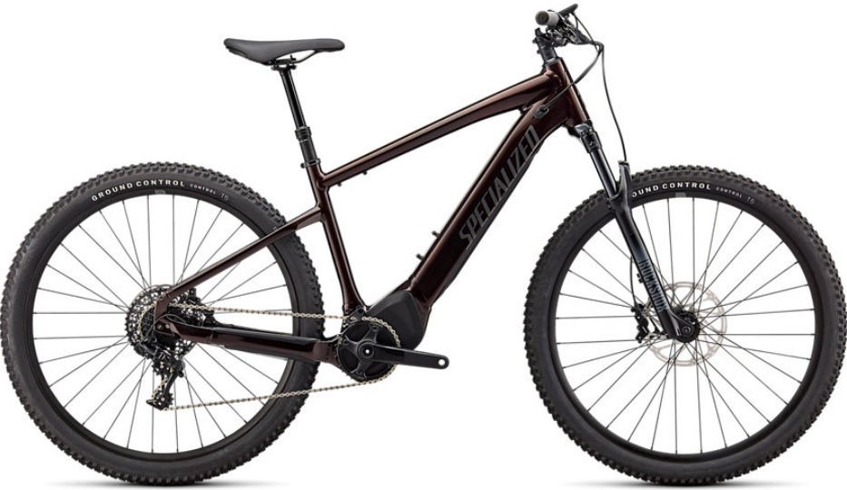
Red Onyx / Smoke

The new Turbo Tero is an electric mountain bike equipped for everyday rides. A mountain bike that you can commute on. A commuter you can take touring. A touring bike that you can haul freight with. Whatever you need it to be, for wherever you want to go. A true do-it-all superhero, Tero combines adaptable utility with World Champion mountain bike DNA and category-leading electric pedal assist.