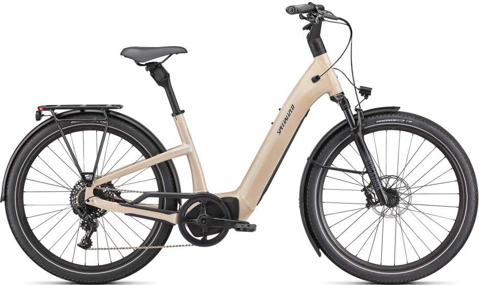
Sand / Black Reflective