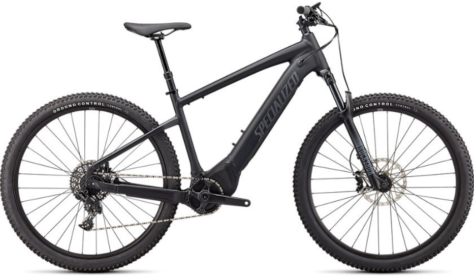
Black / Black

The new Turbo Tero is an electric mountain bike equipped for everyday rides. A mountain bike that you can commute on. A commuter you can take touring. A touring bike that you can haul freight with. Whatever you need it to be, for wherever you want to go. A true do-it-all superhero, Tero combines adaptable utility with World Champion mountain bike DNA and category-leading electric pedal assist.