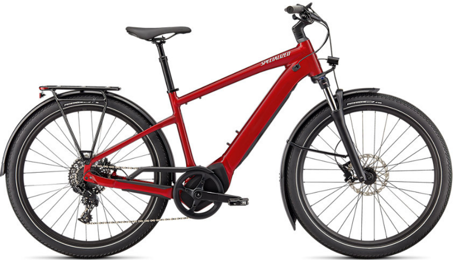
Red Tint / Silver Reflective